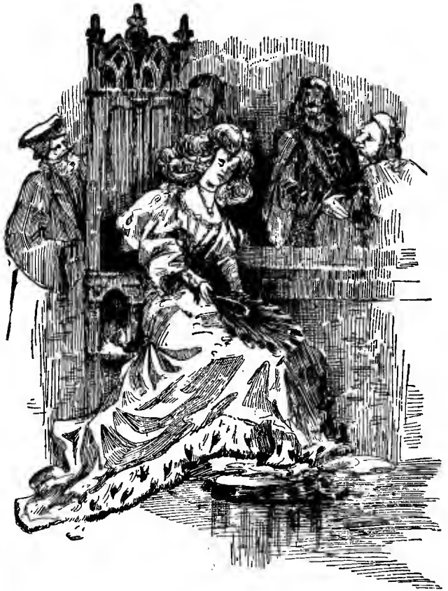
THE BEAUTY OF CONSTANCE